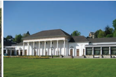
16 Kurhaus in the 19th century and today