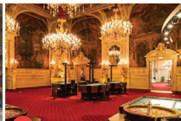
17 Weinbrennersaal in the Kurhaus