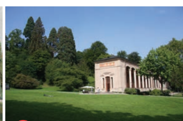
1 Trinkhalle, historic view