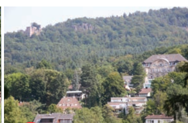
3 Paths skirting the Michelsbach