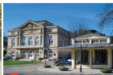
19 Colonnades in the 19th century